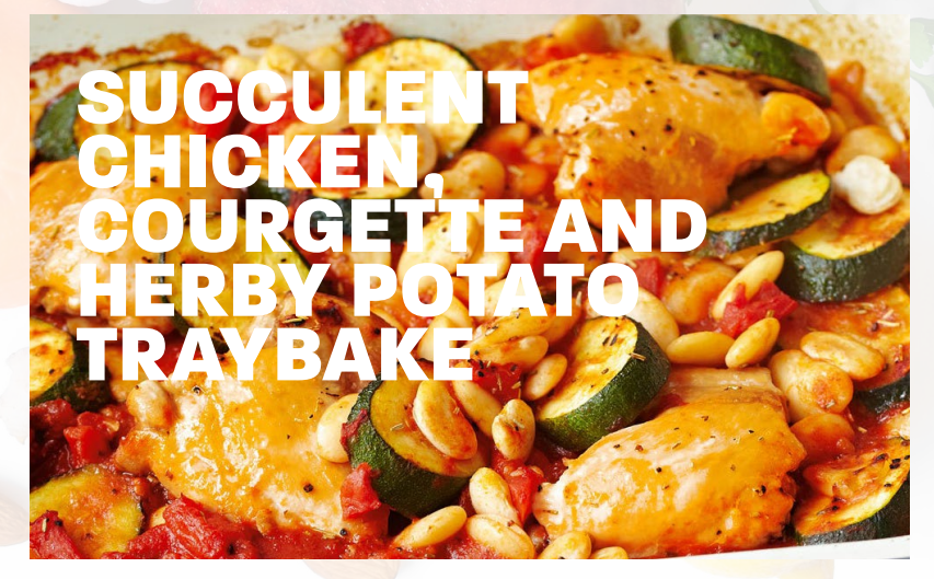
Serves: 2 Prep time: 15 minutes Cook time: 50 minutes

Head of Culinary Operations – ESS Defence, Marine & Aerospace